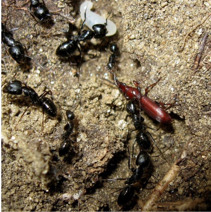
Fig. 1. A. coronata with C. aethiops (Gega Village, Ograzhden Mt.).

Odrintsi and Byalo Pole Villages, Ivaylovgrad District, N41.445555 E26.137511, 276 m, 15.07.2015, 3 ♂♂, 1 ♀, at light, leg. S. Beshkov, B. Zlatkov, C. Plant (NMNHS); Strandzha Mts., Kalovo Village, N42.13639 E27.536389, 330 m, 06.05.2009, 1 ex., under stone, with Camponotus aethiops , leg. A. Lapeva-Gjonova; East from Novo Hodzhovo Village at Pirinska Bistritsa River, N41.407377 E23.406988, 115 m, 14.06.2010, 1 ♀, at light, leg. O. Sivilov, B. Zlatkov; Tisata Reserve in Kresna Gorge, N41.745853 E23.153900, 220 m, 21.06.2013, 1 ♀, at light, leg. O. Sivilov, B. Zlatkov (BFUS).